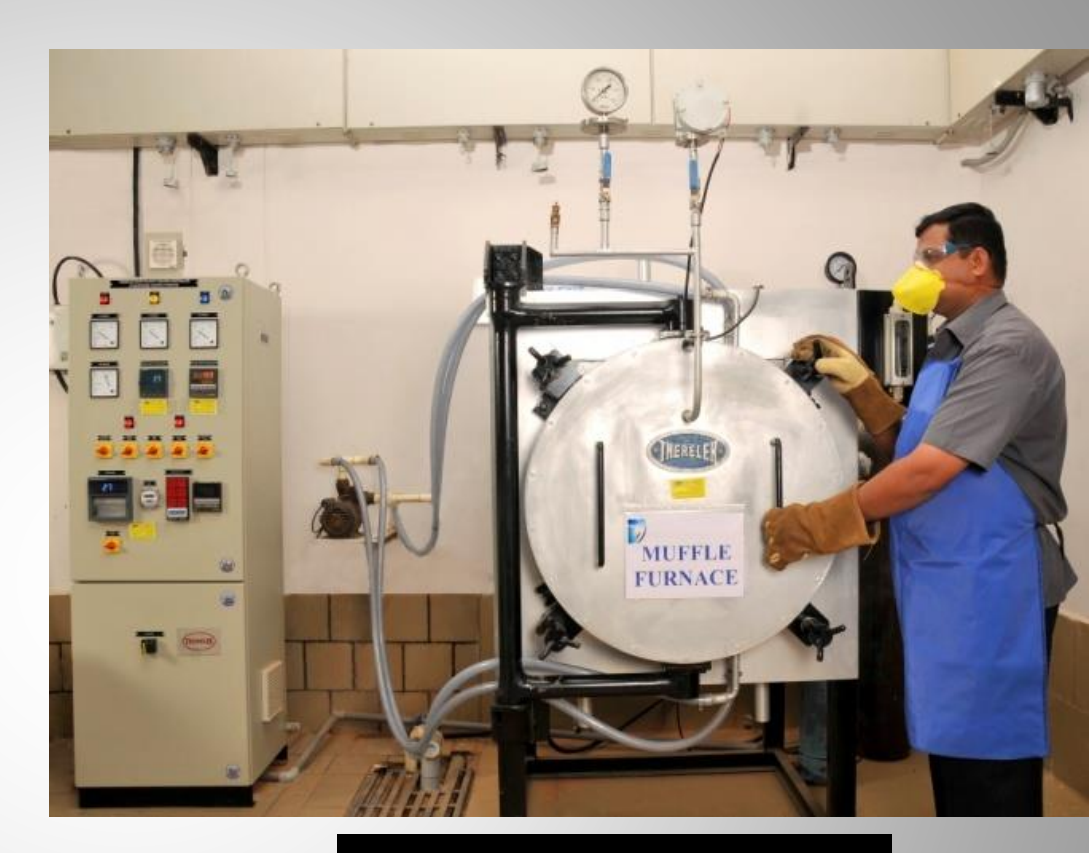
Muffled Furnace (High Baking) (Operating at inert atmosphere)