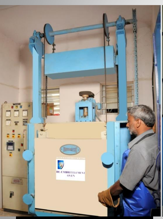
Hydrogen De-Embrittlement Oven & Heat Quench Test

Sheen is NADCAP accredited to perform the following Specimen testing.